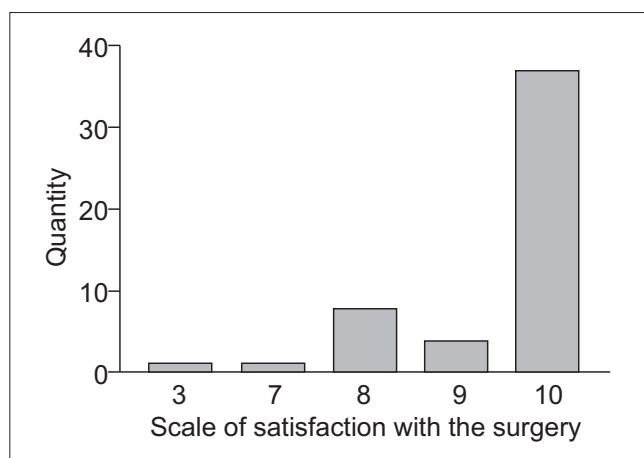
Picture 4. General level of satisfaction as for the surgery ascribed by the parents of children with adenotonsillar hyperplasia and submitted to adenotonsillectomy.

to the children without rhinitis ( 9.71 \pm 0.68 ; *p = 0.007 ) (Table 1). All interviewees who did not present a maximum level of satisfaction (27.5%) had rhinitis.