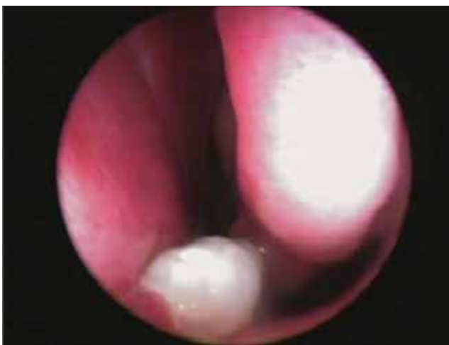
Picture 1. Nasal video-endoscopy confirming a mass on the left nasal cavity floor.

Dental injuries reach 1.7% of the children per year (2). Among the causes, the traumatic intrusion, a common form of incidence in the primary dentition, reaches 11% of girls and 15% of boys between 0 and 12 year with a peak