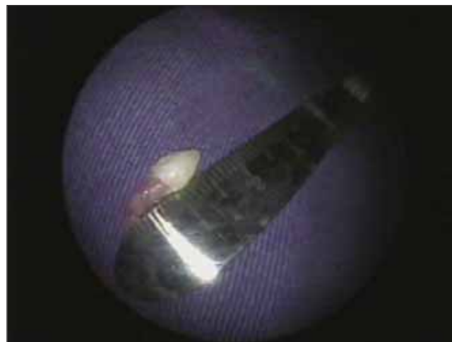
Picture 4. Tooth after surgical extraction.

Despite the uncommon ectopic presentation in nasal