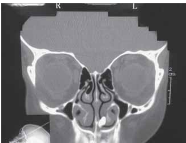
Picture 2. Computed tomography - coronal cut confirming radiopaque image in the left nasal cavity.