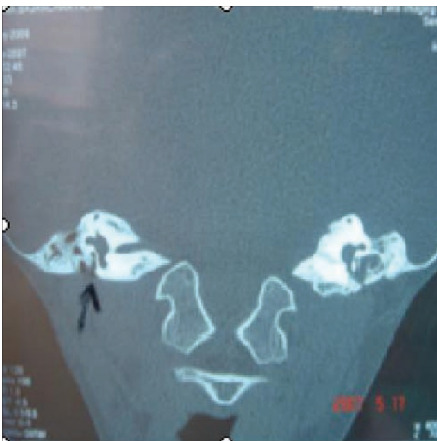
Fig.1. CT Scan showing bilateral absence of pinna and external auditory canal.

The surgery was performed under general anesthesia. The patient was planned for the insertion of the BAHA on the right side since the mastoid bone was thick on that side compared to the left making it easier for the insertion of the implant, as per the CT scan finding. After the postaural skin incision, the implant site was prepared using a guide drill in the mastoid bone. The bone thickness drilled was 2.8 mm. The implant was then inserted in the mastoid bone. The second implant was inserted 1.5 cm posterior to the first implant. Thus, the first stage of the operation was