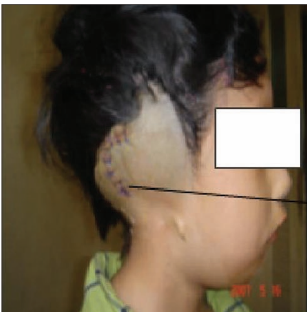
Fig. 3. Postoperative photo of the patient showing sutured site.