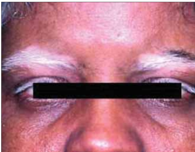
Picture 1. Achromatic stain on the eyebrow (poliosis) – By: Brito AE; Zagui RB; Rivitti EA; Nico MM. Você conhece esta síndrome? An Bras Dermatol. 2005; 80(3):297-8.