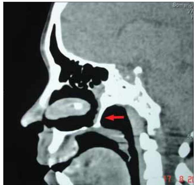
Picture 2. The paranasal sinus CT scan revealed bilateral bone choanal atresia in sagittal cut.

The paranasal sinus CT scan revealed bilateral bone choanal atresia in axial cut (Picture 1) and sagittal cut (Picture 2). The diagnosis was confirmed through nasal endoscopy (Picture 3).