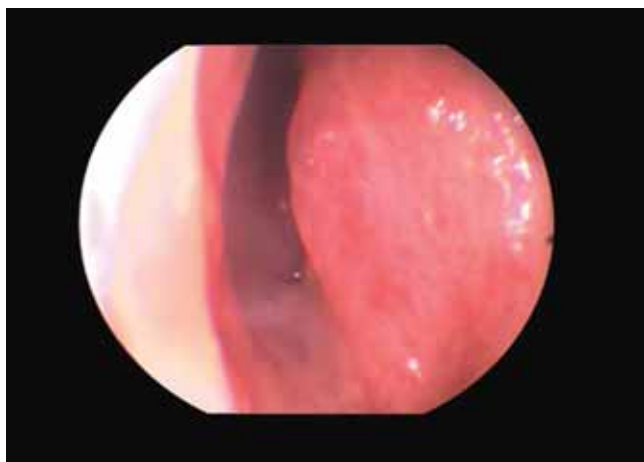
Picture 3. Nasal endoscopy of left nasal fossa proving complete closing of fossa. On the left the septal posterior part can be visualized and the inferior turbinate bottom can be seen on the right.

Topical vasoconstriction was done in the nasal fossa with 1:2,000 adrenaline solution with the use of cottonoid, associated to infiltration of 1:100,000 adrenaline and Xylocaine solution. Rhinofarynx was protected with gauze.